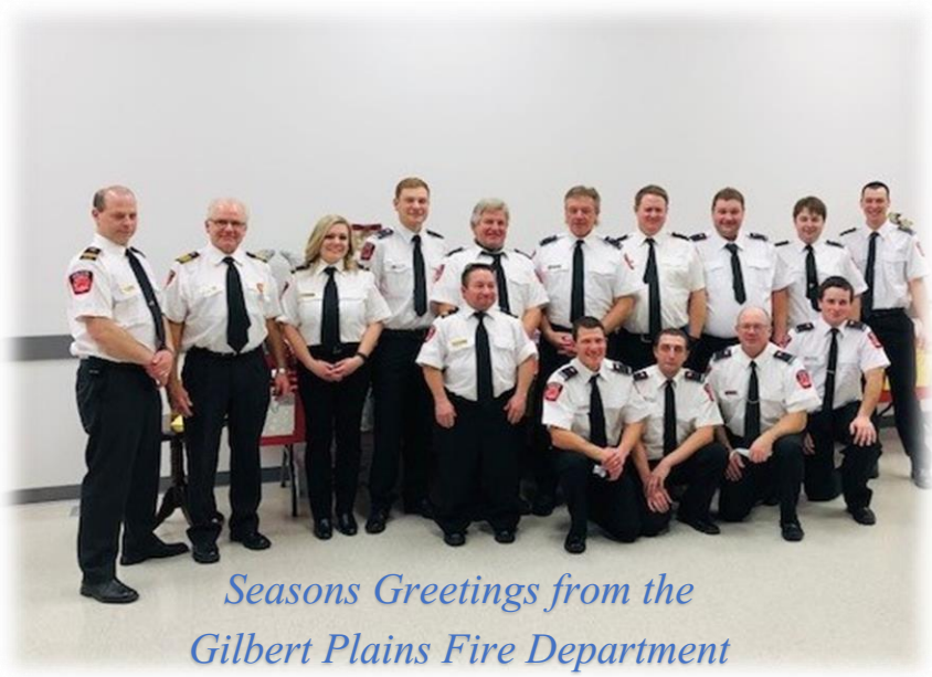
Seasons Greetings from the Gilbert Plains Fire Department